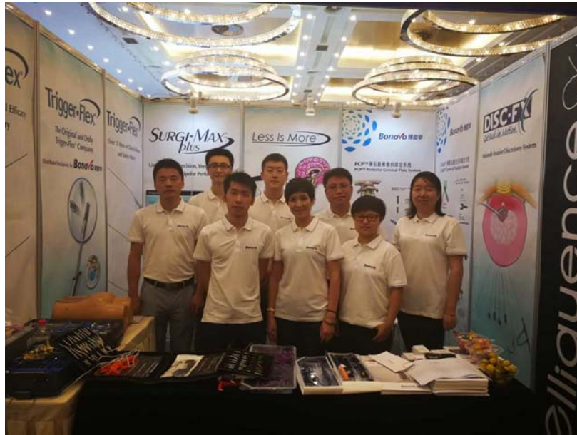
Bonovo's elliquence team