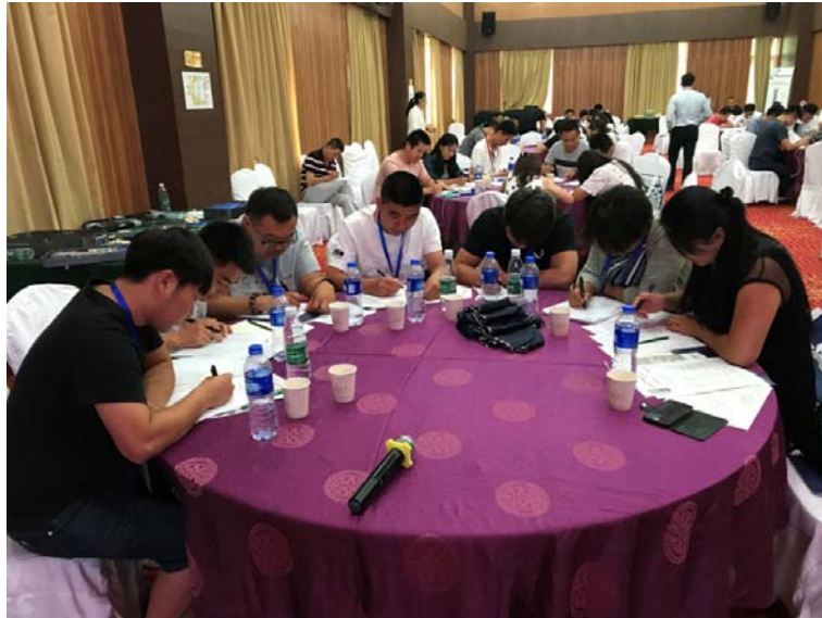
Fig. 4 Distributors having a test