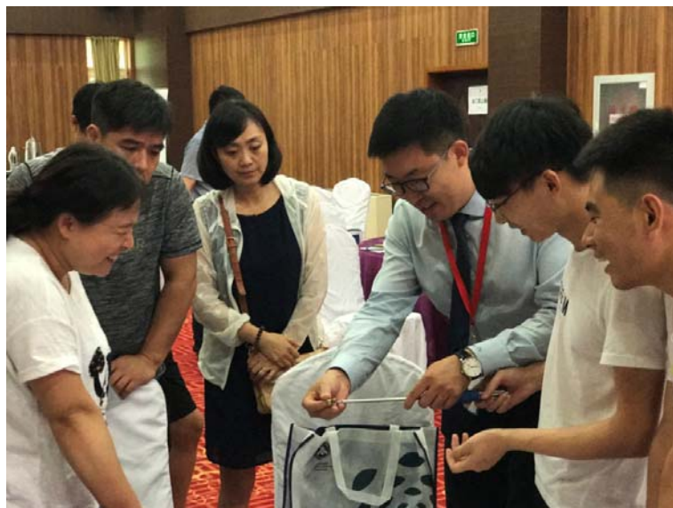
Fig. 5 Mr. Dines De communicating with distributors on how to use surgical tools