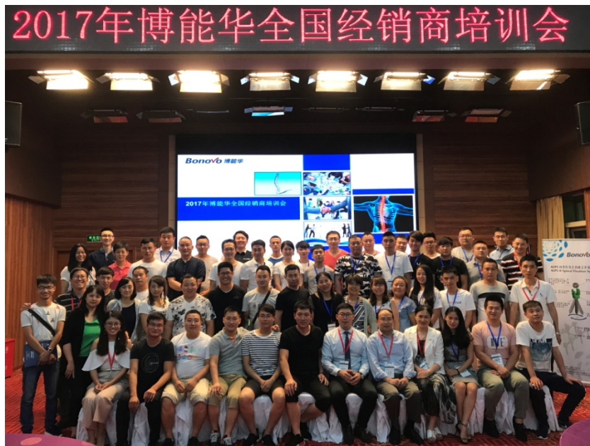
Fig. 7 group photo